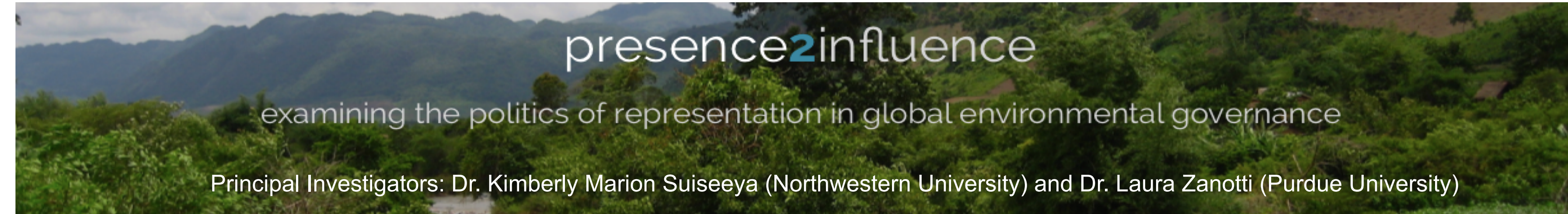
Poster by Dorothy Hogg (Northwestern University)

The three most prominent themes arising from our analysis of the spatializing practices we observed in built spaces, technology, and maps at COP21 and WCC are their roles in: (1) operating as avenues for access or absence, (2) providing opportunities for legitimacy or contestation, and (3) hindering ability to exert agency and authority. The image matrix above demonstrates how we observed and generated themes across images.